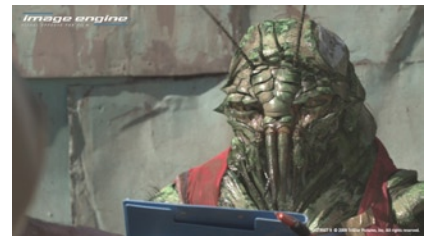
District 9.

* Savings based on USD SRP. International pricing may vary.