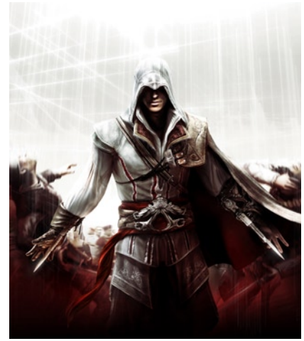
Assassin's Creed II.

Get MotionBuilder 2011 as part of the Autodesk® Entertainment Creation Suites 2011 and save. The Suite includes Maya or 3ds Max along with MotionBuilder and Mudbox at a reduced price*. Learn more at www.autodesk.com/entertainmentcreationsuites .