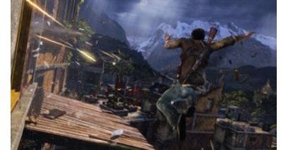
Uncharted 2: Among Thieves™. Image courtesy of Naughty Dog, Inc.

Wherever characters need to be animated, Autodesk® MotionBuilder® software can help you to increase your productivity and achieve higher-quality results. In fact, many facilities have achieved up to a 250 percent gain in animation output per artist using MotionBuilder. Built on a real-time 3D architecture, MotionBuilder provides a highly responsive, interactive environment to create, edit, and play back complex character animation.